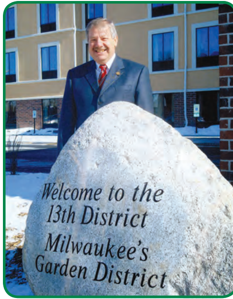
Curb appeal and signage have become key elements in marketing our Garden District. This rock carving is located at the Sleep Inn & Suites at 4600 S. 6th St.